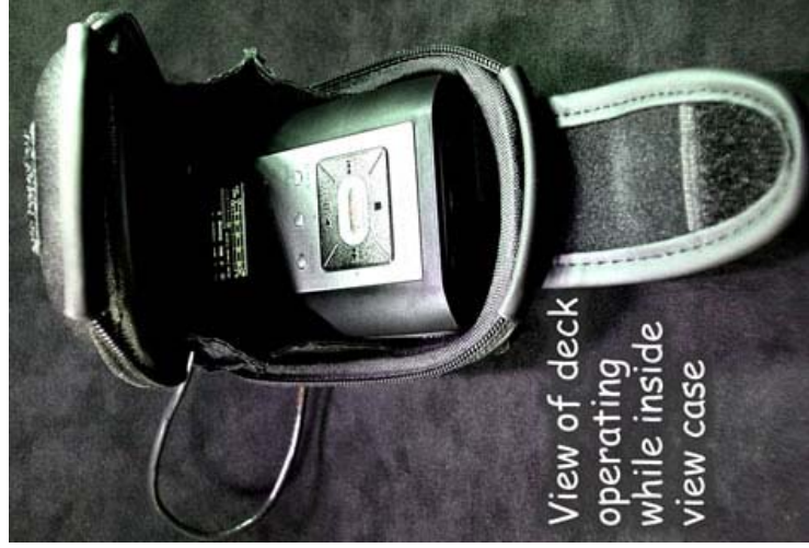
View of deck operating while inside view case