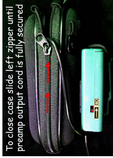
To close case slide left zipper until preamp output cord is fully secured

NOTE: If preamp output cord is shorter than shown, this ONLY limits left side zipper travel, but suggested securing technique works as shown regardless.