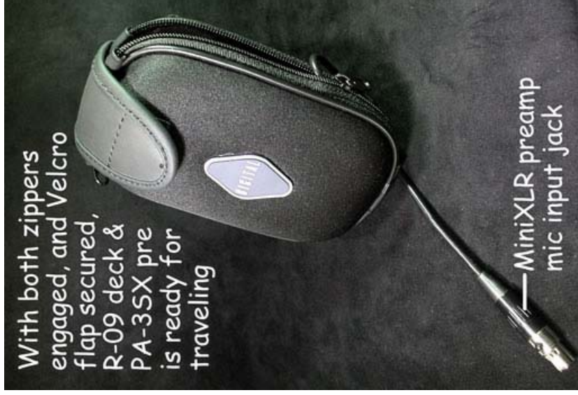
With both zippers engaged, and Velcro flap secured, R-09 deck & PA-3SX pre is ready for traveling