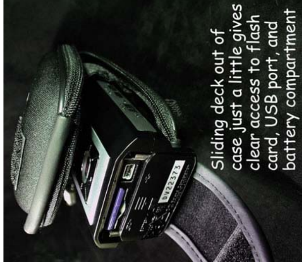
Sliding deck out of case just a little gives clear access to flash card, USB port, and battery compartment